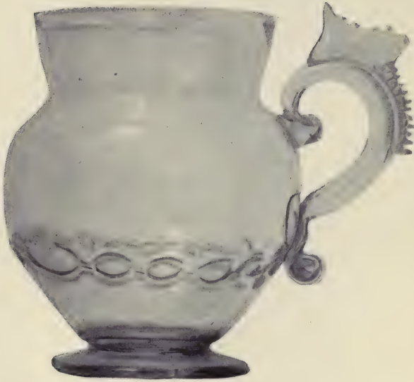
CUP Probably Catalonian